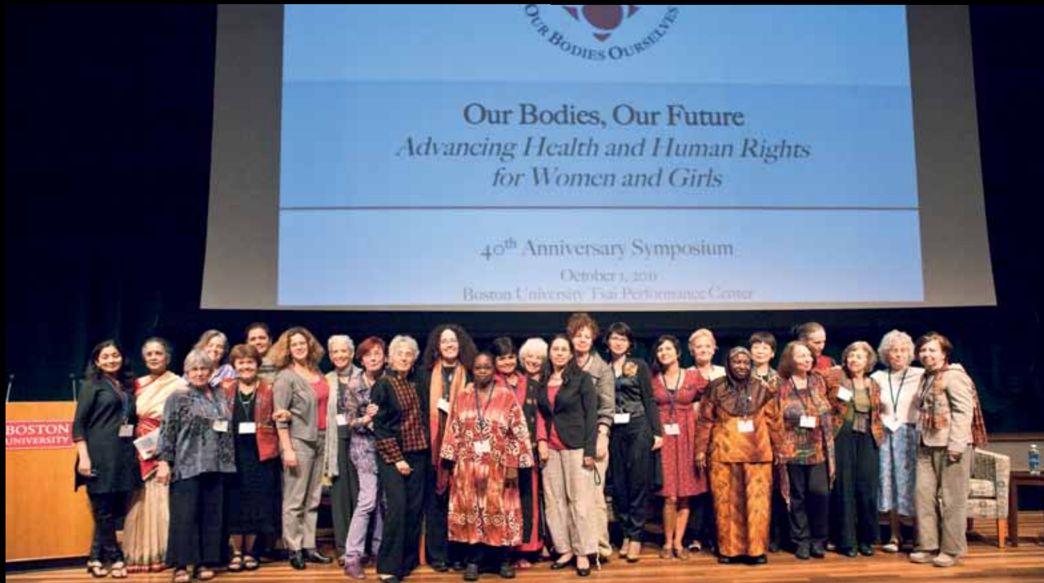
OBOS Global Initiative staff, founders, and global partners