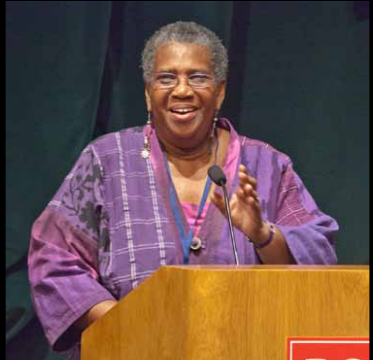
Byllye Avery, founder Avery Institute for Social Change and National Black Women's Health Imperative