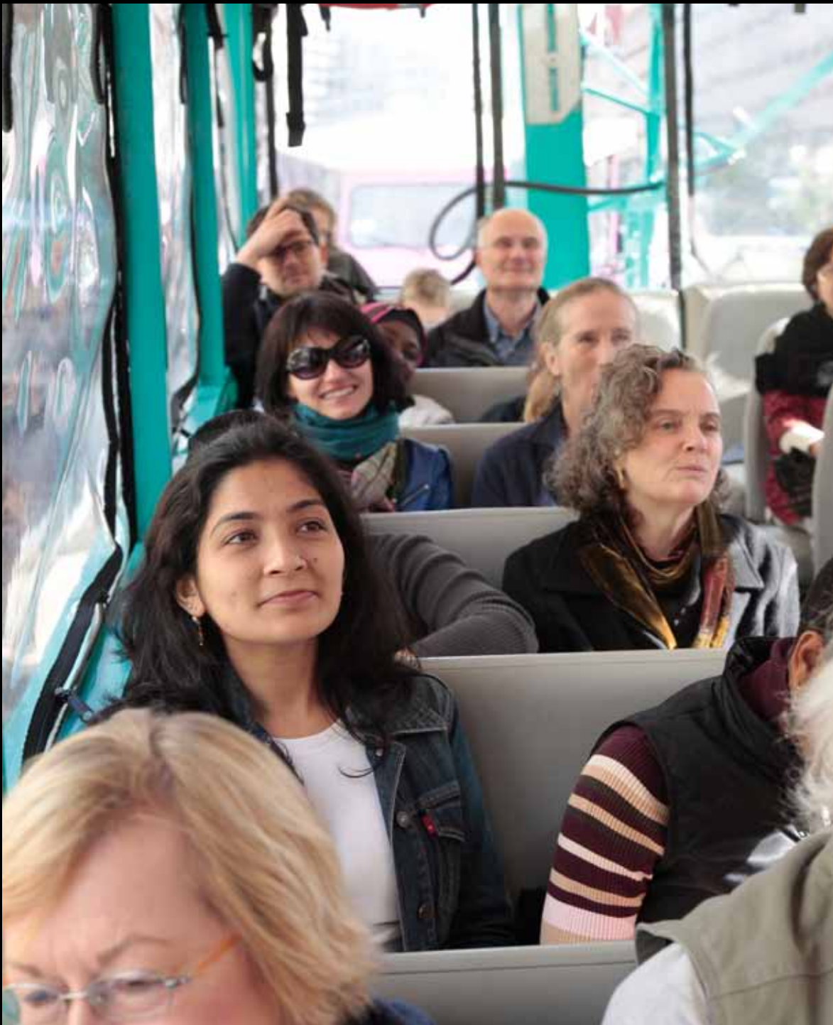
Enjoying the Duck Tour!