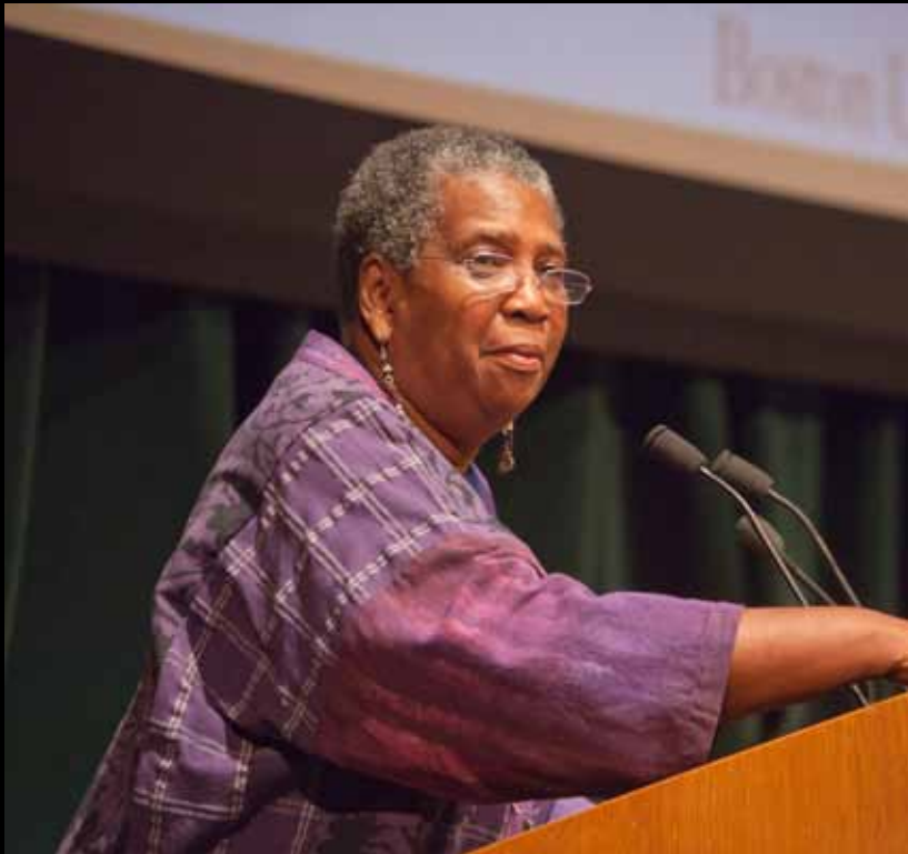
Byllye Avery, Black Women's Health Imperative