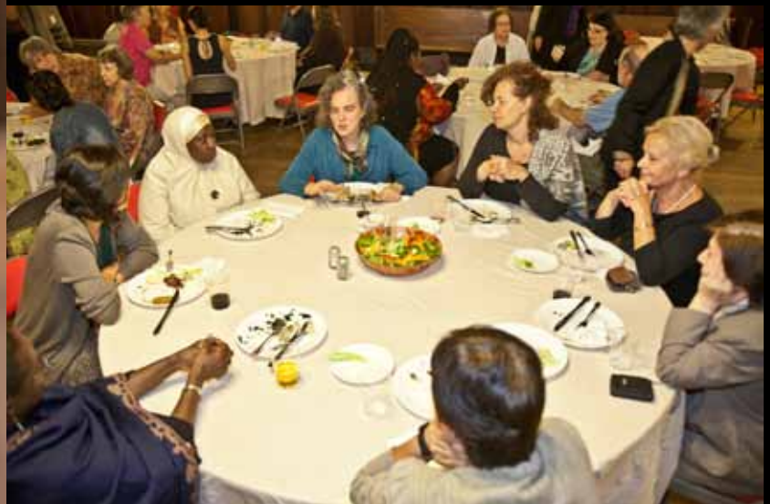
Below: Global partners gather around the dinner table.