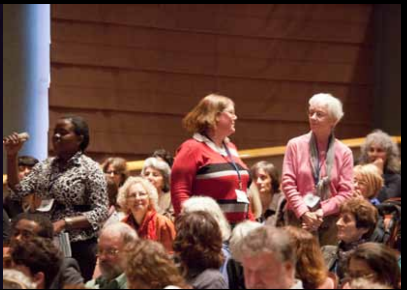
Q & A