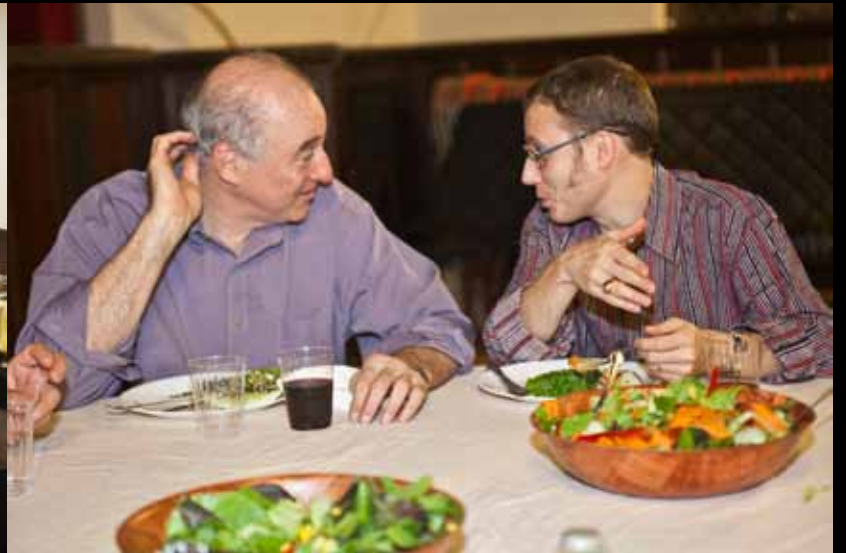
Supportive Spouses of OBOS staff join the celebration.