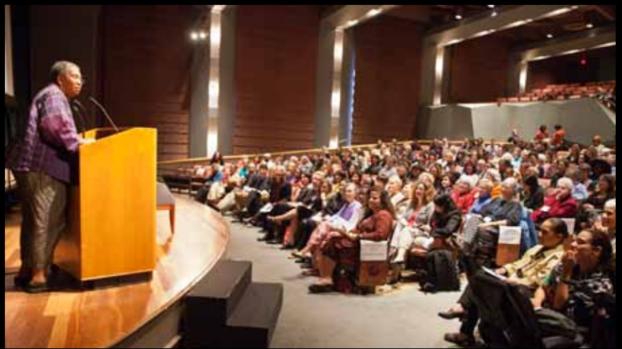
"We are what we have been waiting for." - Byllye Avery